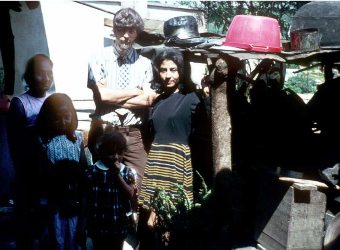
With my short-haired wig and coiled beard, I bid a sad farewell to my saving maidens of joy.

up having to use the apostles' horses to escape - not only from guerrillas and the military, but also from these saving angels of light of mine.