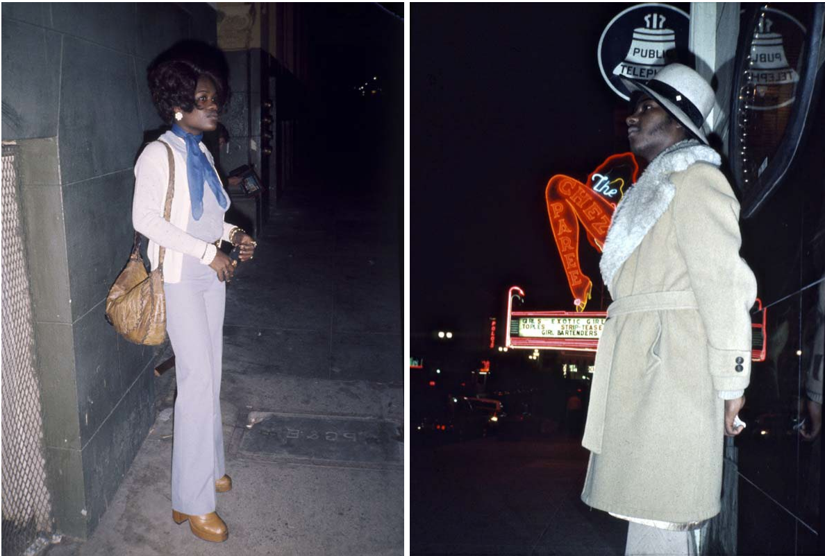
One of my friends from the building on the street outside and a pimp